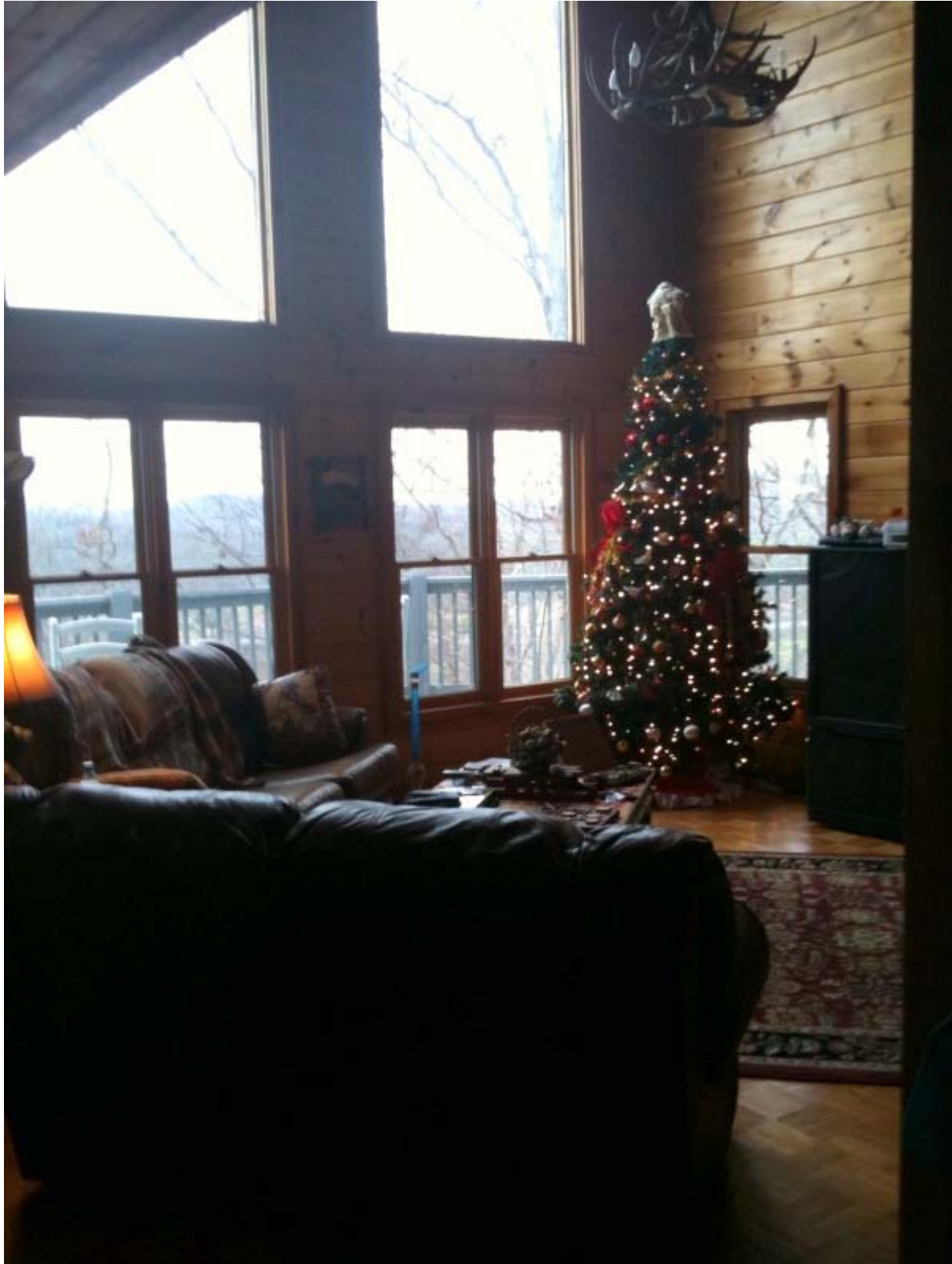
Vacation in a beautiful tri-level, four bedroom, mountain home in Blue Ridge, GA,