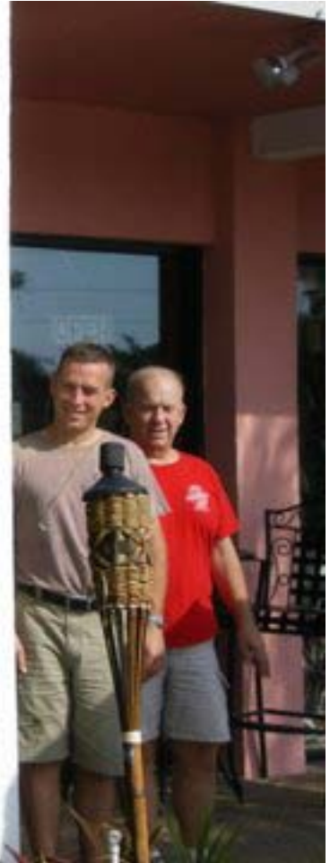
With delicious picnic lunch from Sanibel Deli and Coffee Factory