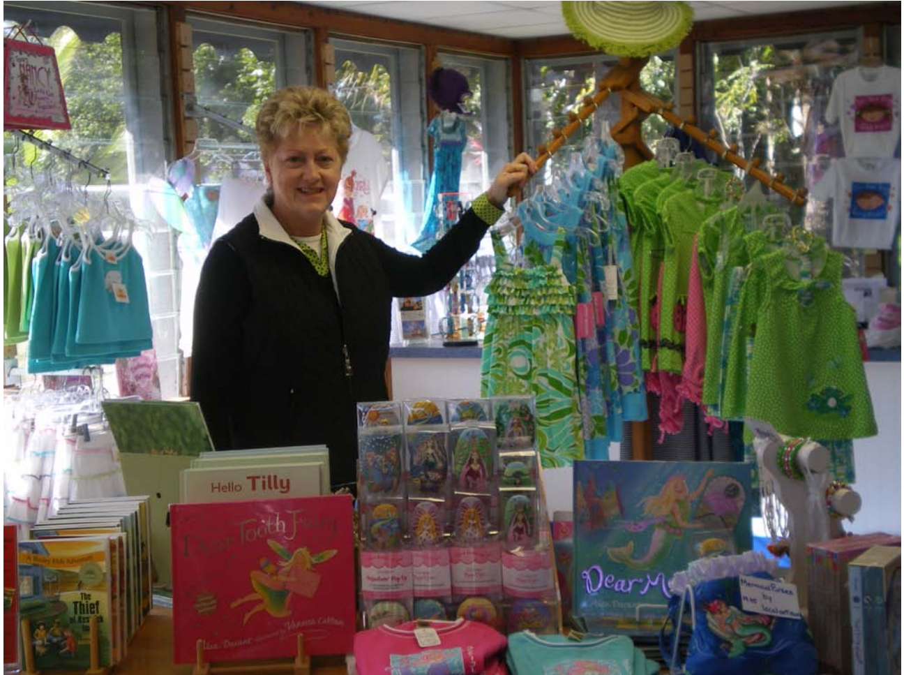
shopping at Nanny's Children's Shoppe